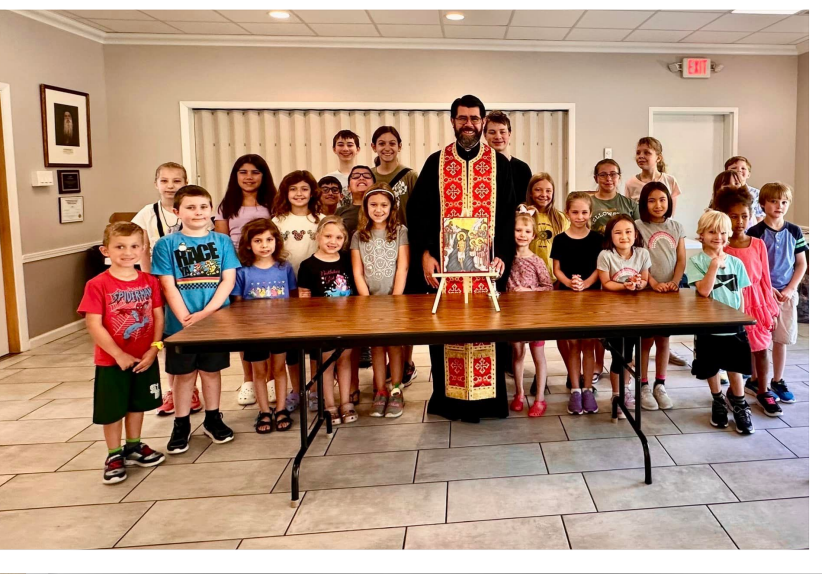
Vacation Church School kids