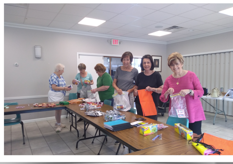
Philoptochos July CCM work - packing Blessing Bags!