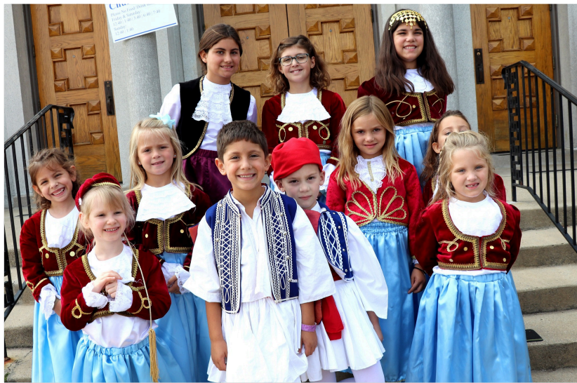
Greek Dancers at the Festival