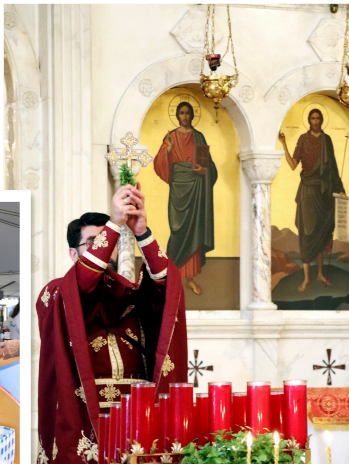
Elevation of the Holy Cross