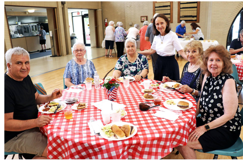
Young at Heart Luncheon