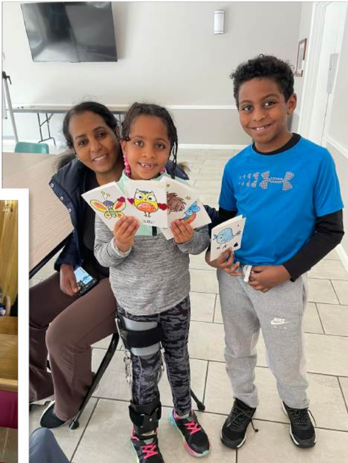
HOPE/JOY kids making cards for Acts of Kindness.